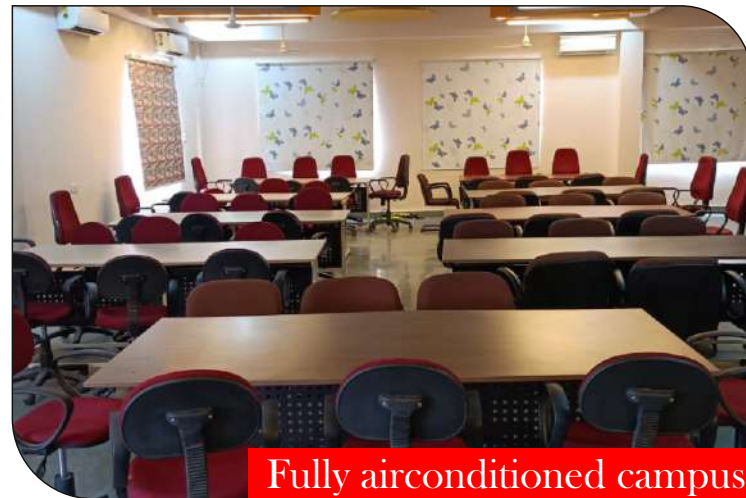
Fully airconditioned campus