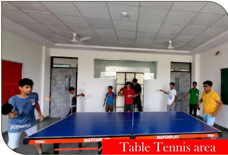
Table Tennis area