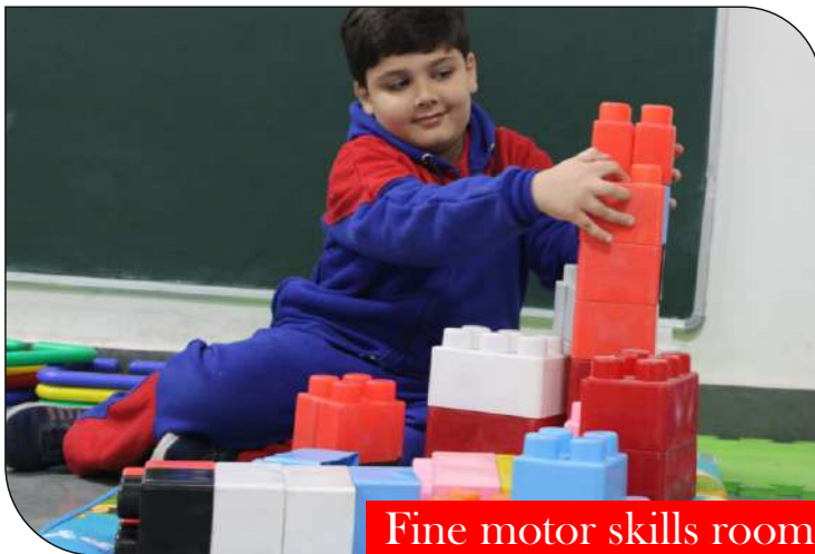
Fine motor skills room